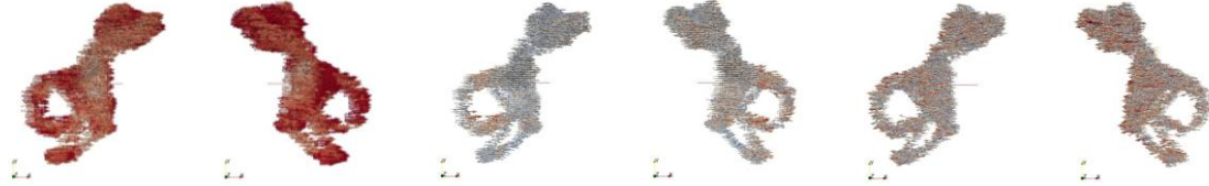
Fig 2. The vibration of the semicircular canals in x-direction.

Simulation on both the translational and rotational motions have been calculated. For the setting of the translational motion utilizes a sinusoidal motion in the x-direction at frequency 1000 Hz is given. The time interval is 0.000001 second and the amplitude of displacement is 1mm and is achieved at time 0.00025 seconds.